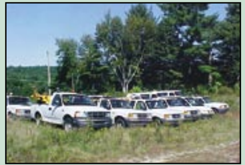
VIEW OF SEVERAL PICKUPS