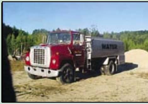
FORD WATER TRUCK