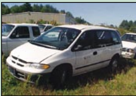
1 OF 2 VANS