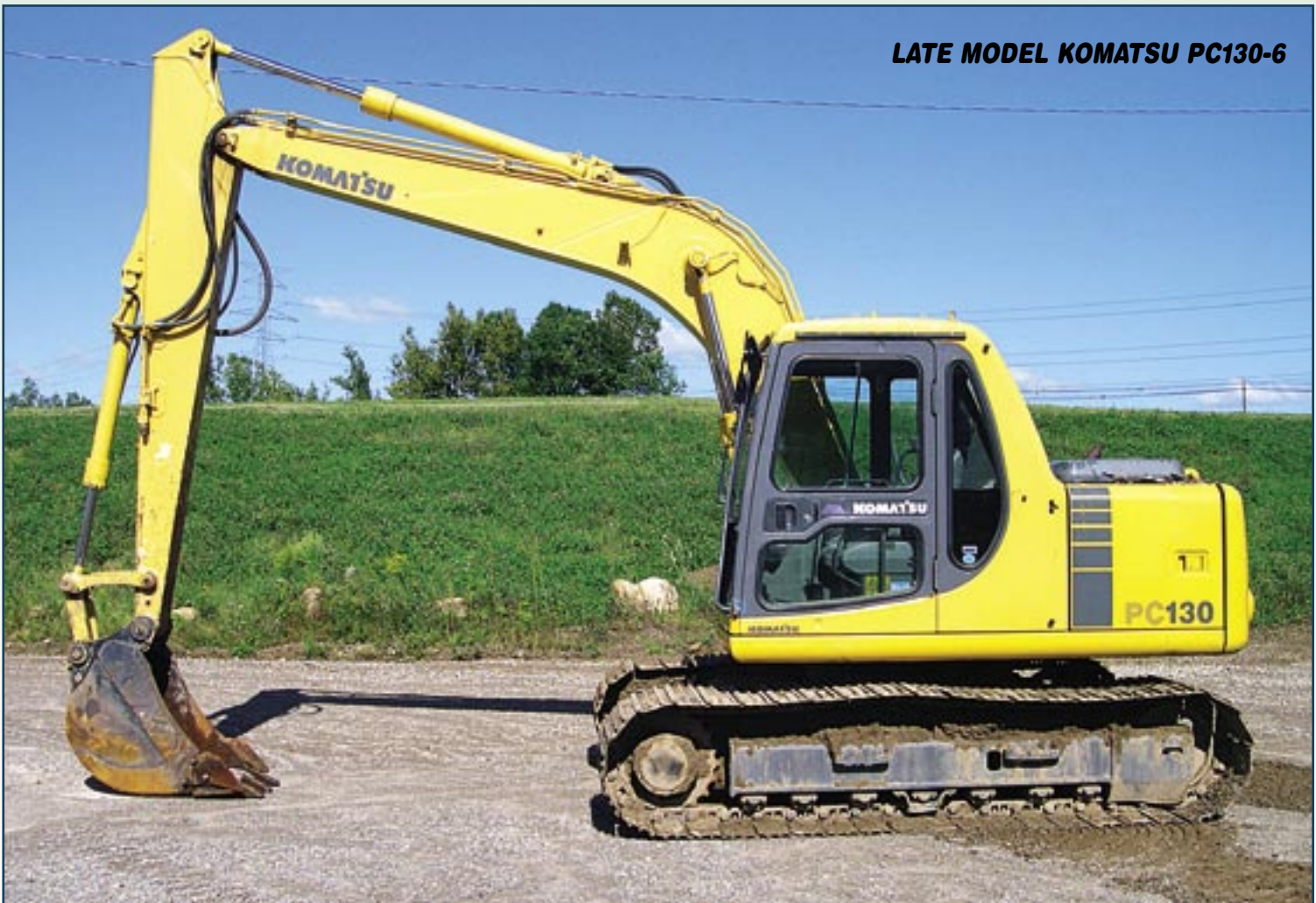
LATE MODEL KOMATSU PC130-6