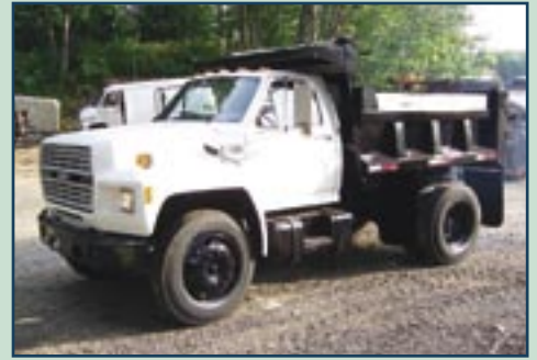
1990 FORD F700